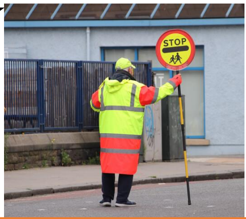
School Crossing Patrol