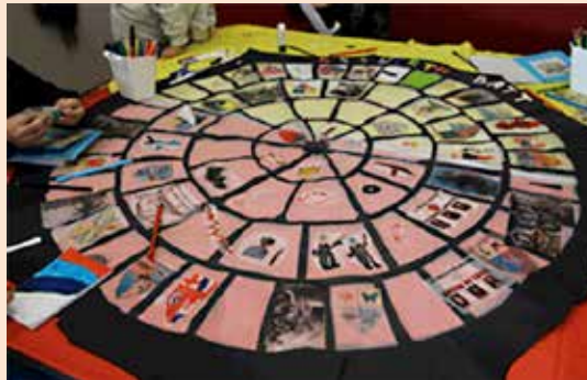
Stained Glass Legacy Board