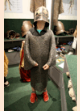
Bosworth Battlefield Heritage Centre