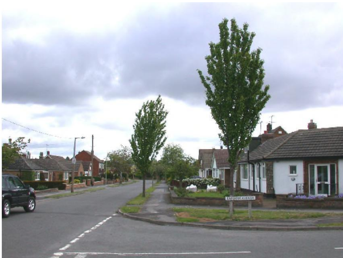
Figure L2 Fastigiate cherries planted in a narrow verge do not spread into neighbouring property or over the highway