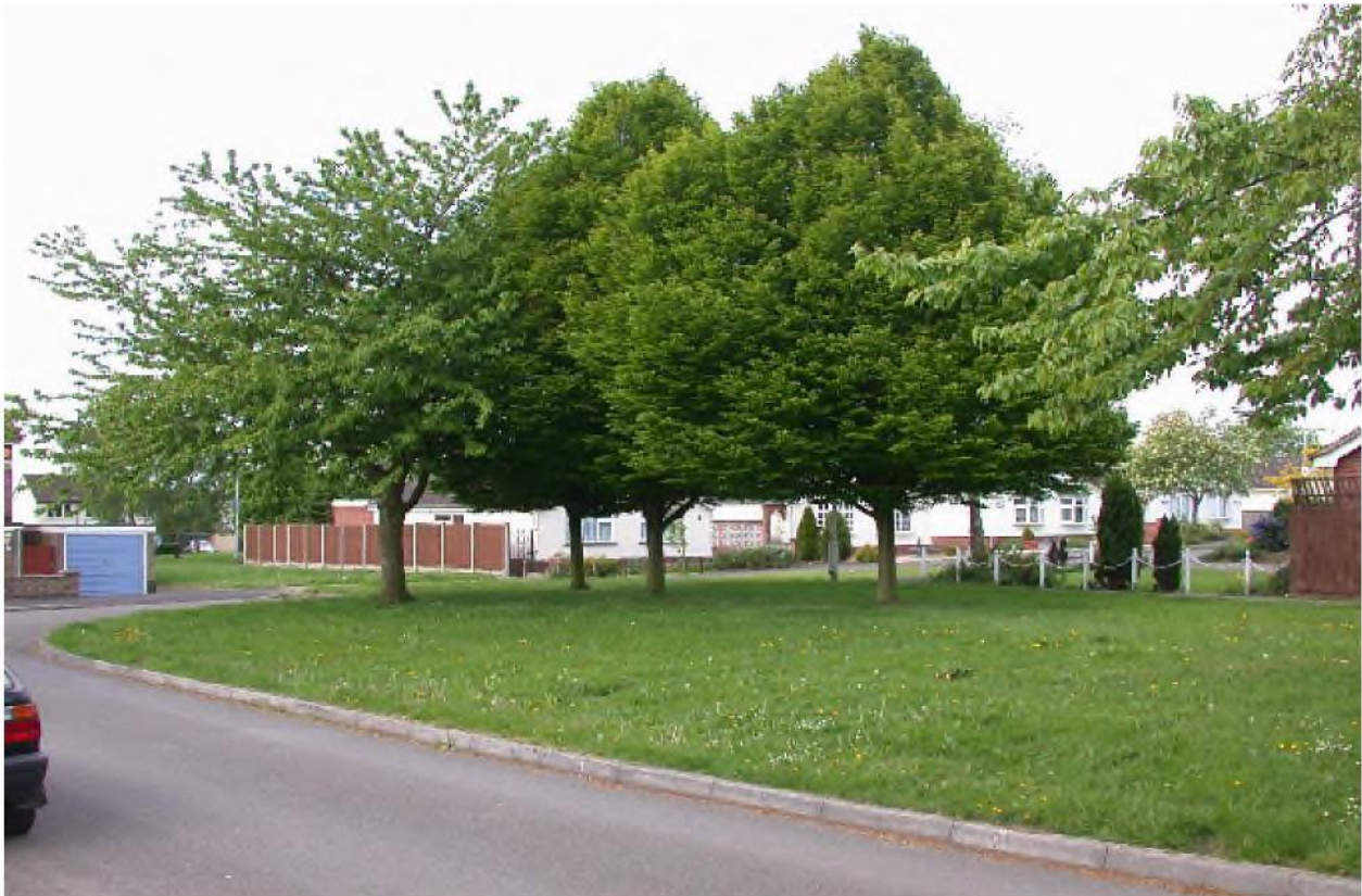
Figure L1 A mixed-tree group on an area of open space, well away from house frontages