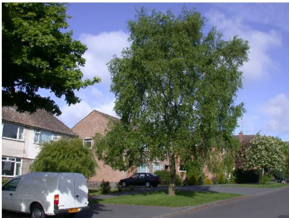
Figure L5 Correct tree selection. Silver birch on a reasonable verge area allows sunlight through to the house frontage.