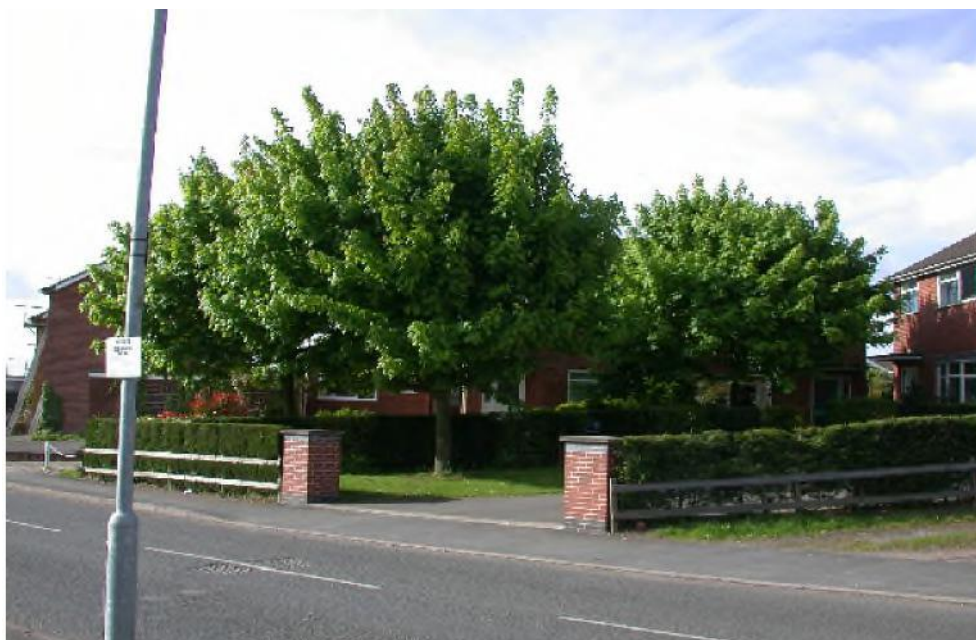
Figure L6 Poor tree selection. Three Norway maples, at approximately one-third of their potential size in small gardens, completely dominating the house frontages.