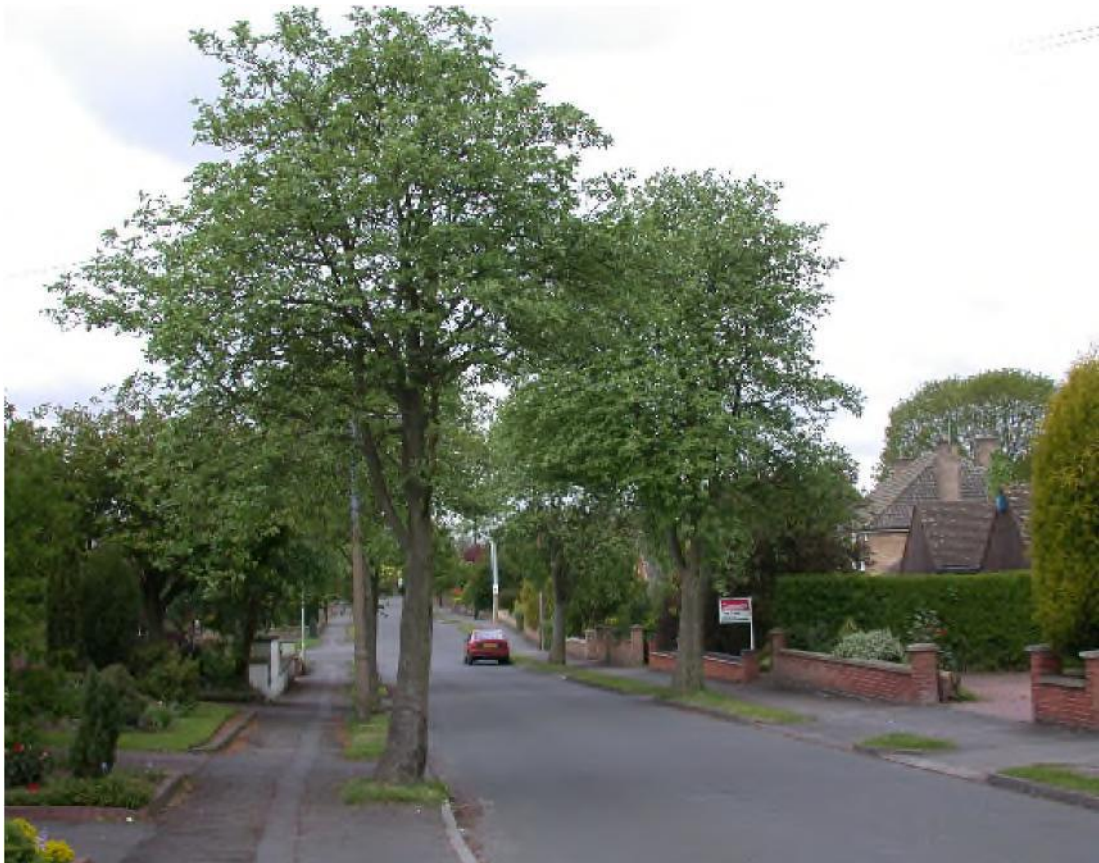
Figure L3 Trees planted in very limited subterranean space, affected by service trenching and outgrowing their site. This causes a maintenance problem for the highway authority